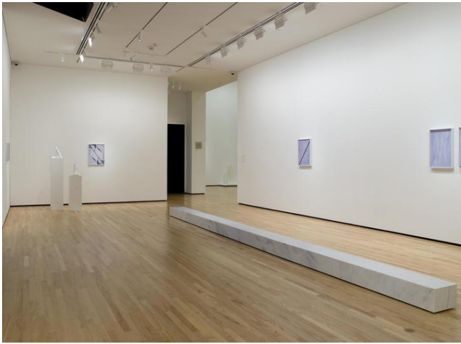
Sara VanDerBeek pays homage to Baltimore.

Alumna Sara VanDerBeek has a solo exhibition of photography and sculpture in the Front Room at the Baltimore Museum of Art. The internationally acclaimed artist's new works are inspired by Baltimore-based dancers, urban architecture, a salvage yard, and the BMA's collection. A series of photographs illuminates fragments of Baltimore architecture shot in the city's neighborhoods and at Second Chance salvage yard. They're paired with images of dance students at the UMBC. The exhibition also features three sculptures, including one created from the white marble typical of the stairs leading up to Baltimore row homes.